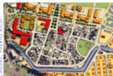
CAGUAS, PUERTO RICO