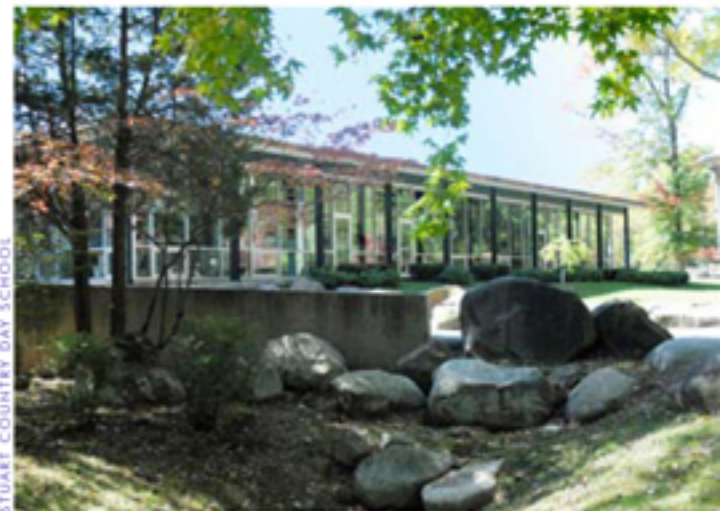
STUART COUNTRY DAY SCHOOLS