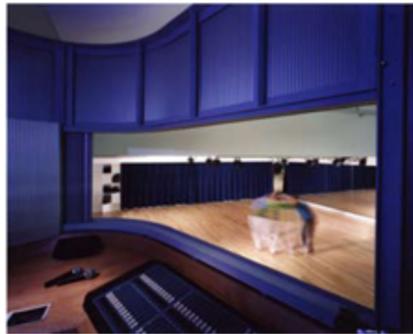
DALTON PERFORMING ARTS